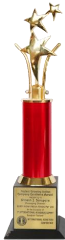
FASTEST GROWING INDIA COMPANY EXCELLENCE AWARD - 2015