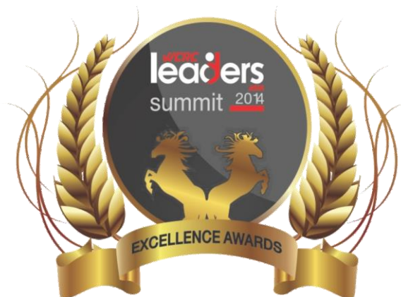
ASIS'S FASTEST GROWING MARKETING BRANDS, WCRC-204