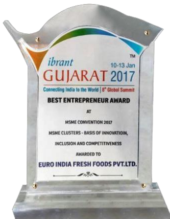
VIBRANT GUJRAT 2017 BEST ENTREPRENEUR AWARD