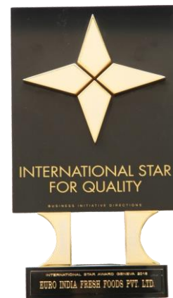
INTERNATIONAL STAR FOR QUALITY AWARD - GENEVA - 2015