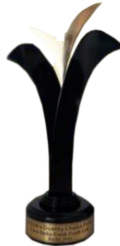
ESQR'S QUALITY CHOIC PRIZE - 2016