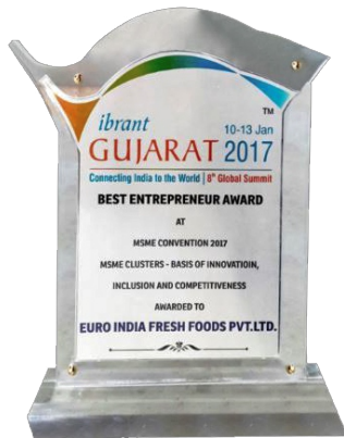
VIBRANT GUJRAT 2017 BEST ENTREPRENEUR AWARD