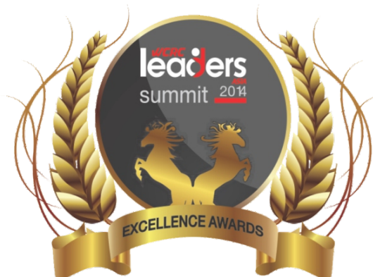
ASIS'S FASTEST GROWING MARKETING BRANDS, WCRC-204